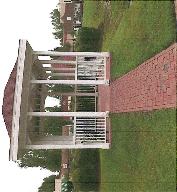
Memorial Brick walk to the Gazebo