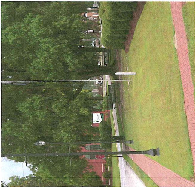
View of Memorial Walk to and around the Oak tree canopy with Memorial Benches.